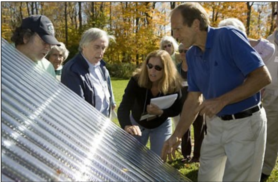
Participants learn about solar energy and tour a solar-powered home