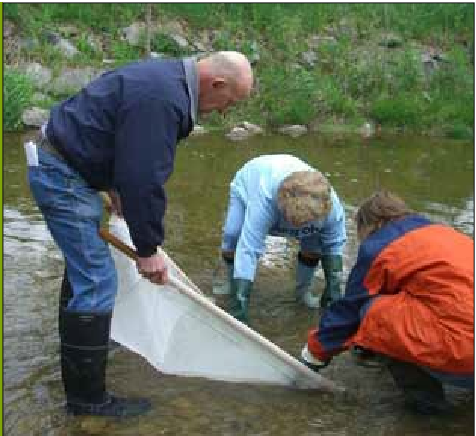
Participants engage in stream cleanup as part of a capstone stewardship project