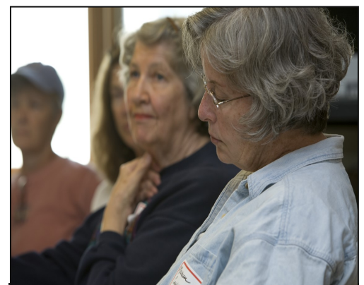
Participants attend introductory workshop

RISE is a hands-on learning experience, including field trips and a capstone stewardship project in the community related to environmental sustainability. The program also promotes ongoing environmental volunteerism following the program.