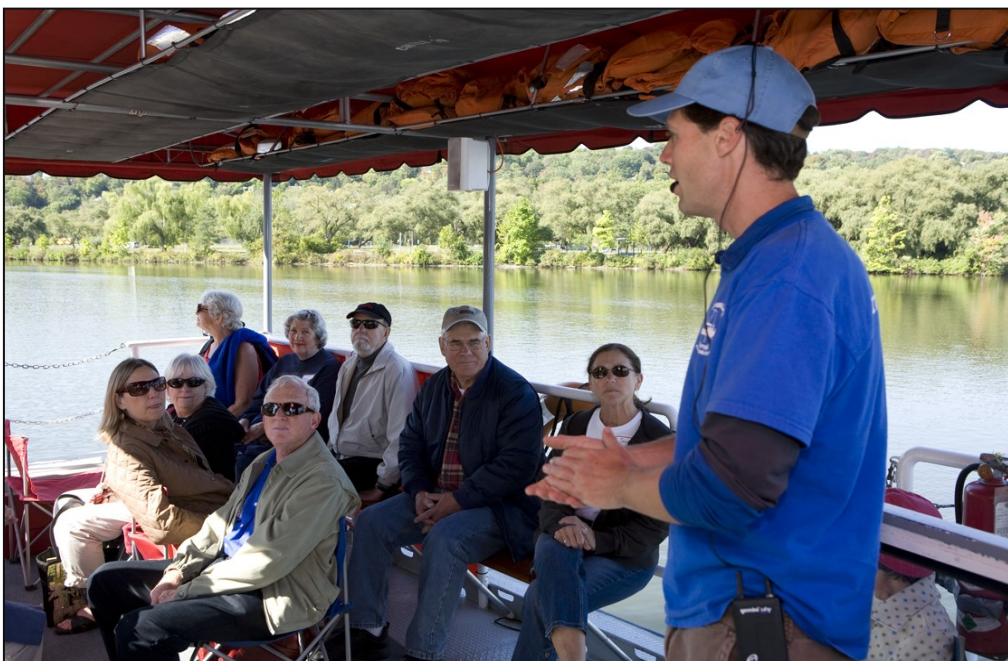
Participants learn about water quality on a floating classroom